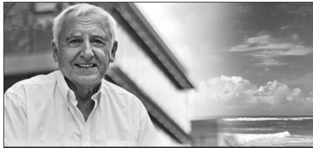
A Trusted Place for Lawyers.