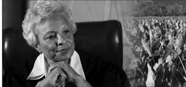
A Trusted Place for Judges.